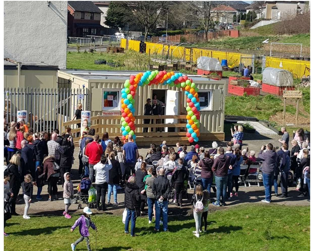
The opening of Cranhill Development Trust's Community Hub