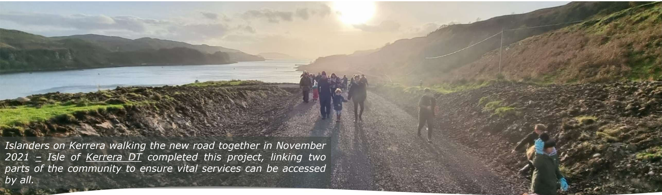
Islanders on Kerrera walking the new road together in November 2021 – Isle of Kerrera DT completed this project, linking two parts of the community to ensure vital services can be accessed by all.