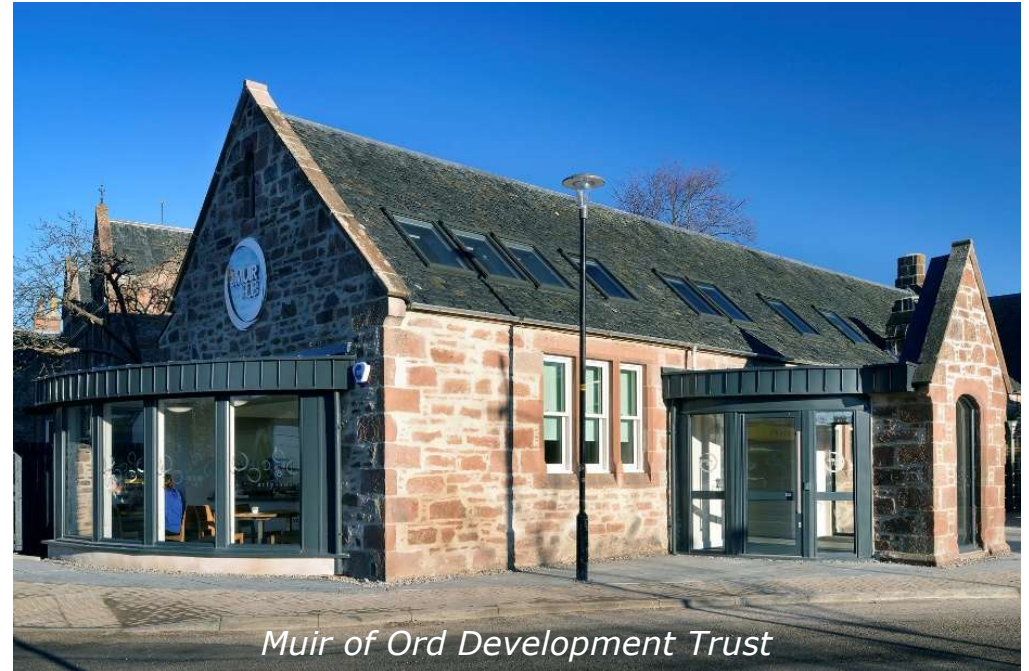
Muir of Ord Development Trust